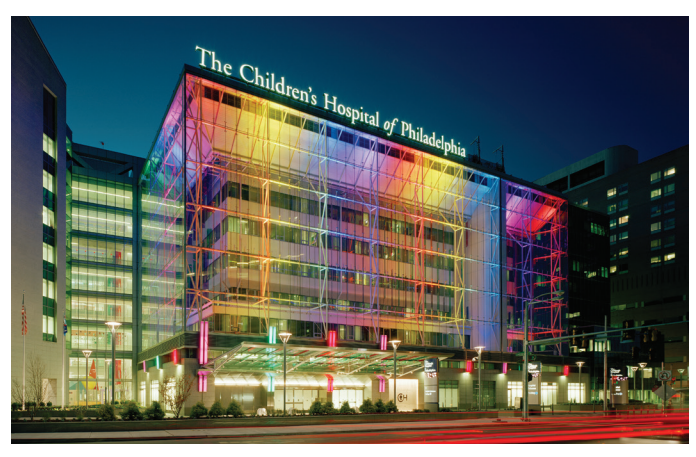
Philadelphia photos courtesty of the Philadelphia Convention and Visitors Bureau. ©2022 The Children's Hospital of Philadelphia/22CME0024/06-22